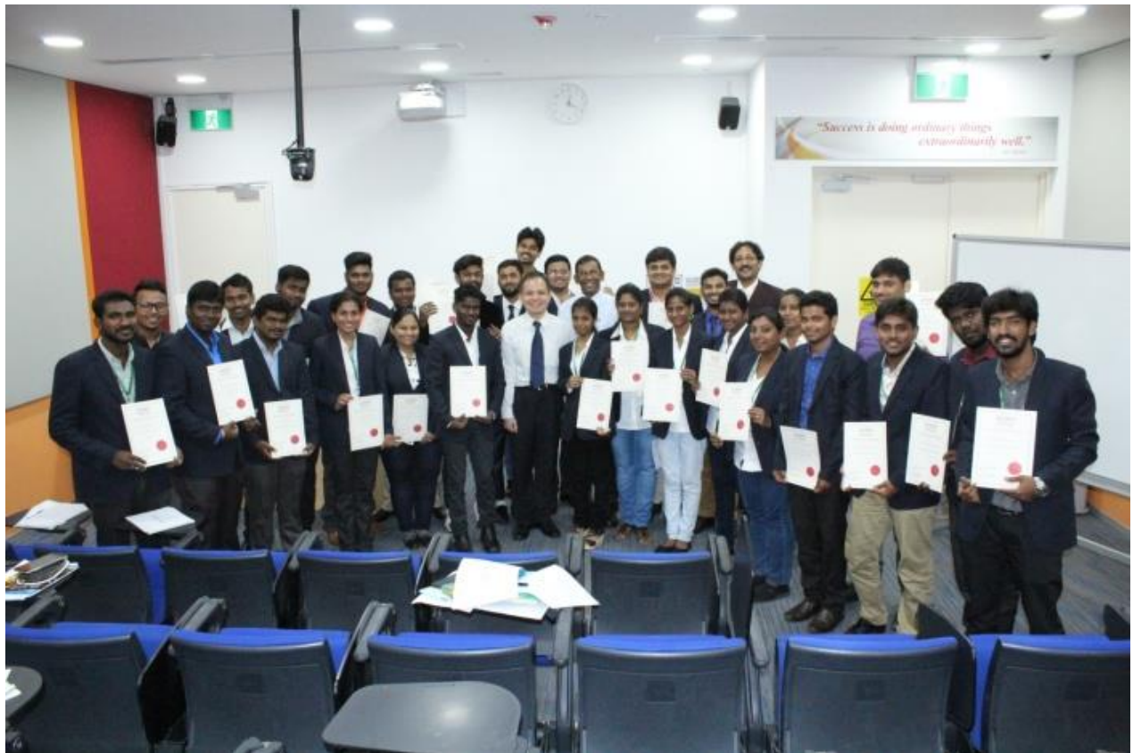
Students had attended a seminar on the topic "Total Production Management (TPM)"